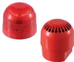
Sounders and Beacons Safe area, intrinsically safe or flameproof options