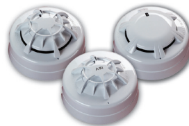
Up to 20 fire/heat detectors per zone