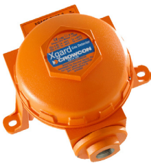
Industry-standard gas detectors