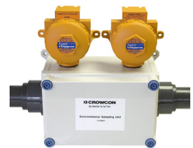
Fan control for Crowcon's Environmental Sampling Unit

Crowcon reserves the right to change the design or specification of the product without notice. Check www.crowcon.com for updates.